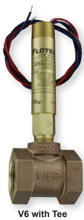
V6 with Tee