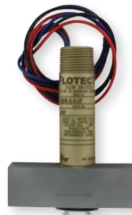
V6 Low Flow